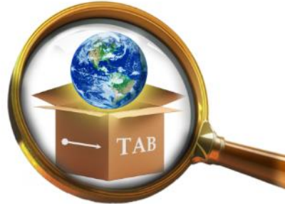
Looking at literature through a Biblical lens

And please leave us a note on our site about your experience! We would love to hear your comments!