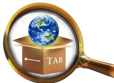
Looking at literature through a Biblical lens

And please leave us a note on our site about your experience! We would love to hear your comments!